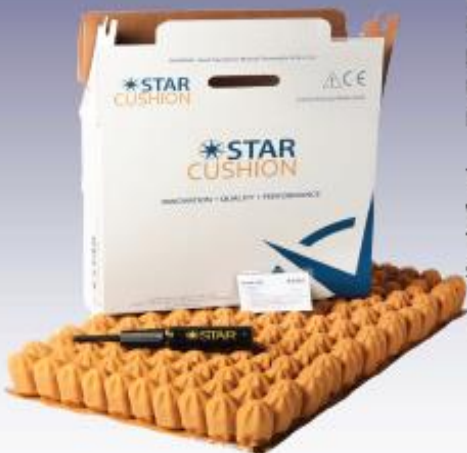
V4 RE-ACT — System 1 (Page 3)

Many configurations of the Star Mattress Inserts can be used for the prevention and treatment of all types of pressure ulcers and pain relief.