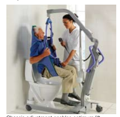
Chassis adjustment enables optimum lift positioning for toileting.