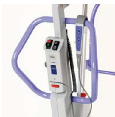
Operate efficiently via the handset or mast control panel. Ergonomically designed push/pull handles for smooth maneuvers.