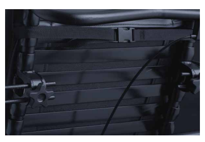
flexes for individualized fit &