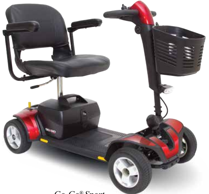
Go-Go® Sport, 4-Wheel