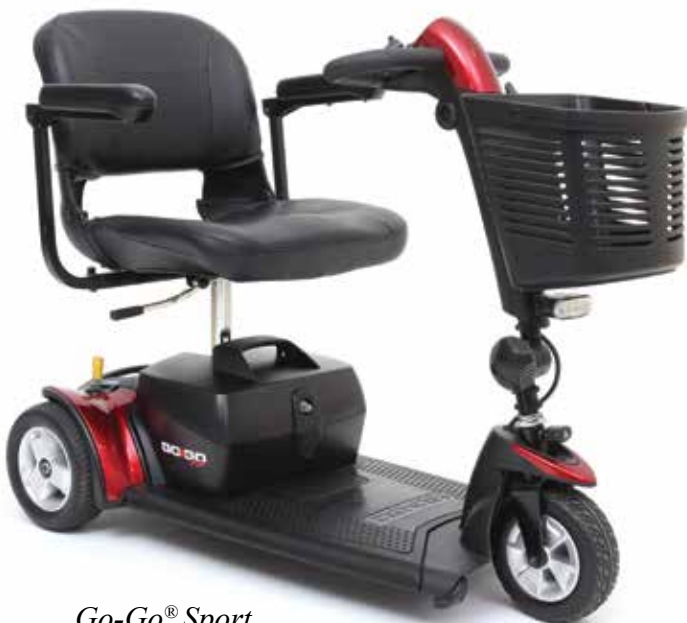
Go-Go® Sport, 3-Wheel

The Go-Go® Sport delivers high-performance operation and easy disassembly for convenience on-the-go. With a 325 lbs. weight capacity, charger port in tiller, and standard front LED lighting, the Go-Go Sport is feature rich and travel ready.