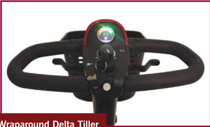
Wraparound Delta Tiller